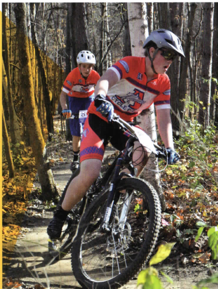
Both the Armstrong and Wayzata teams practice at Theodore Wirth Park's off-road trails at the edge of Golden Valley.